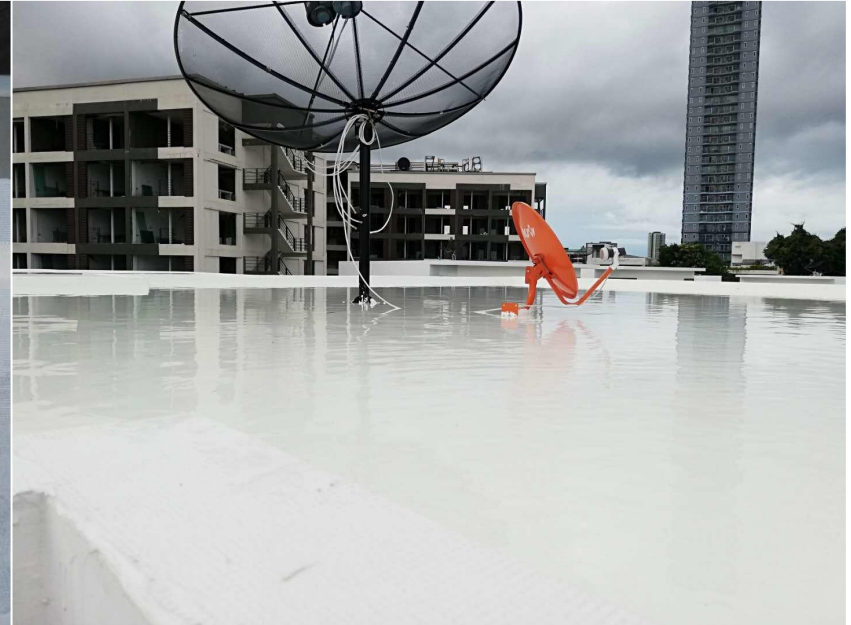
Locates in Pattaya, with acrylic waterproofing coating.